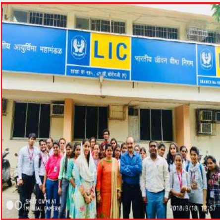
Industrial Visit for BBI students