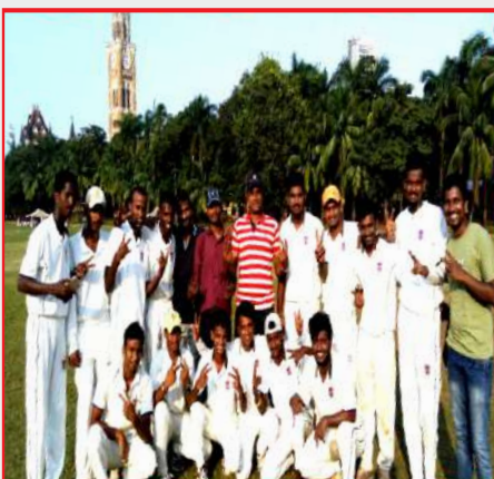
Cricket team of the College