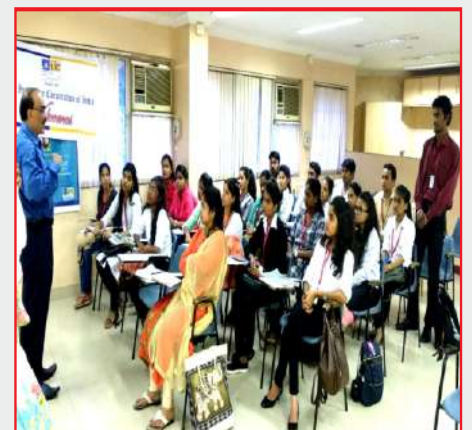
Student Development Program