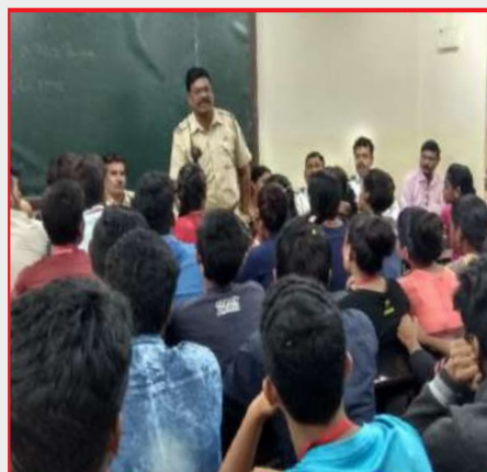
Traffic awareness week programme