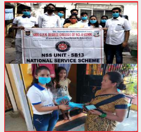
National Service Scheme