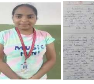
Rank - 1