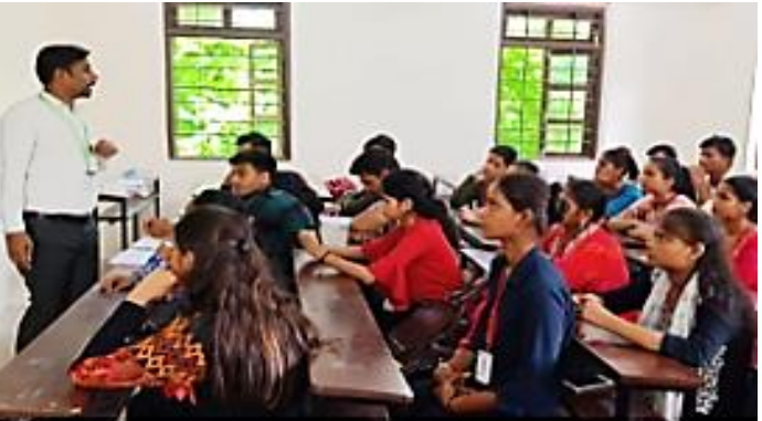
The outcome of the Event...

After participation in the event, our students gained with -