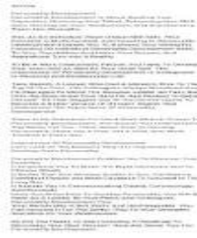
Sumit Bangera (S.Y.B.Com)